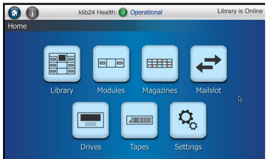
Figure 1. StorageTek SL150 Modular Tape Library Touchscreen Operator Panel

With the StorageTek SL150, simplicity begins with the library installation and continues throughout the life of the product, even as you expand for data growth. The library can be initialized in a few steps via the local touchscreen operator panel, and upgrades are easy, since they require no tools, complicated cabling, or technical support.